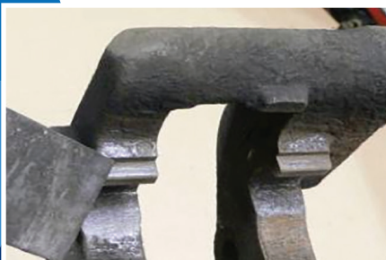
Cleaned Caliper Bracket