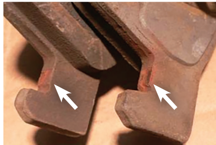
Pad Rust Buildup