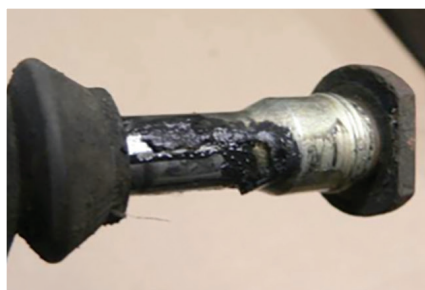
Lubed Guide Pins